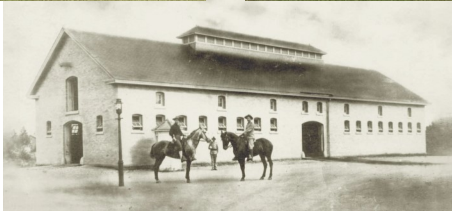
From their website