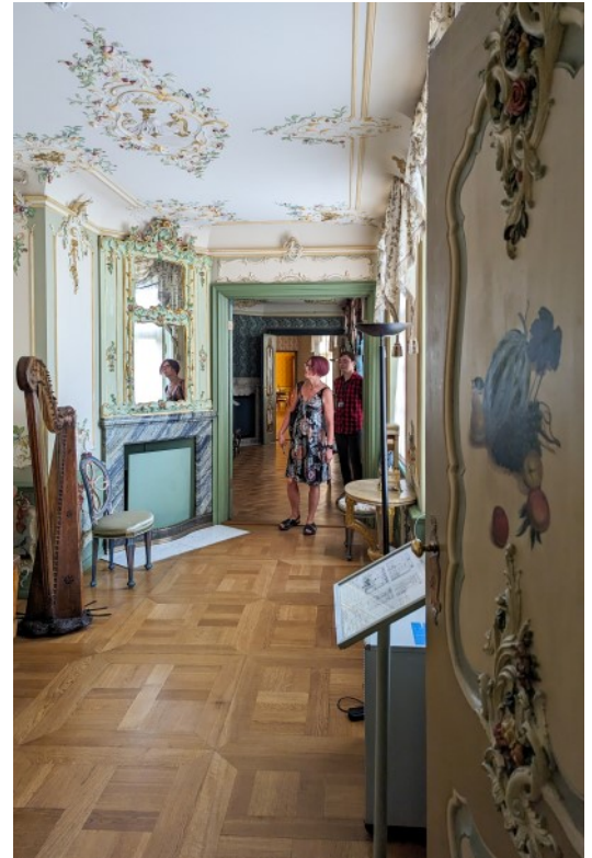
The old Armory, now an art museum