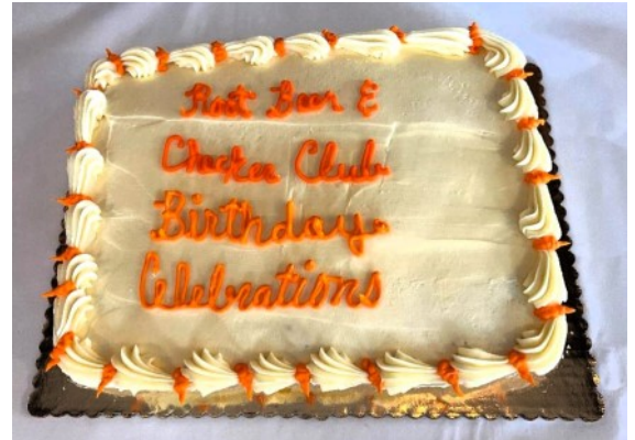
September's Birthday Cake

Consequently, invoices to members will be delayed. We will advise you when the current problem is resolved.