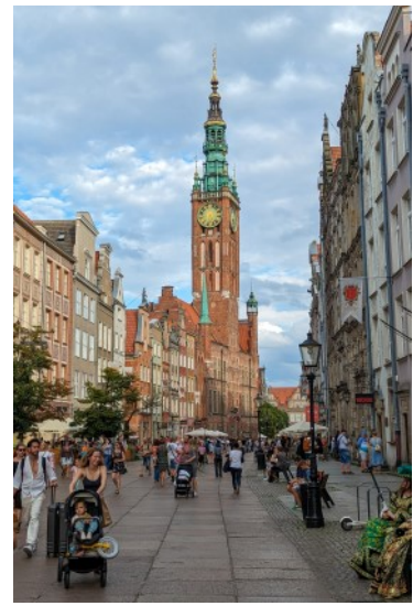
Top left—another gate and square, top right and center left—an indoor market. Center right and bottom left—an outdoor market adjacent to the indoor one. Bottom center—an example of the beautiful stonework fronts. Bottom Right—another view of the street leading to a gate.