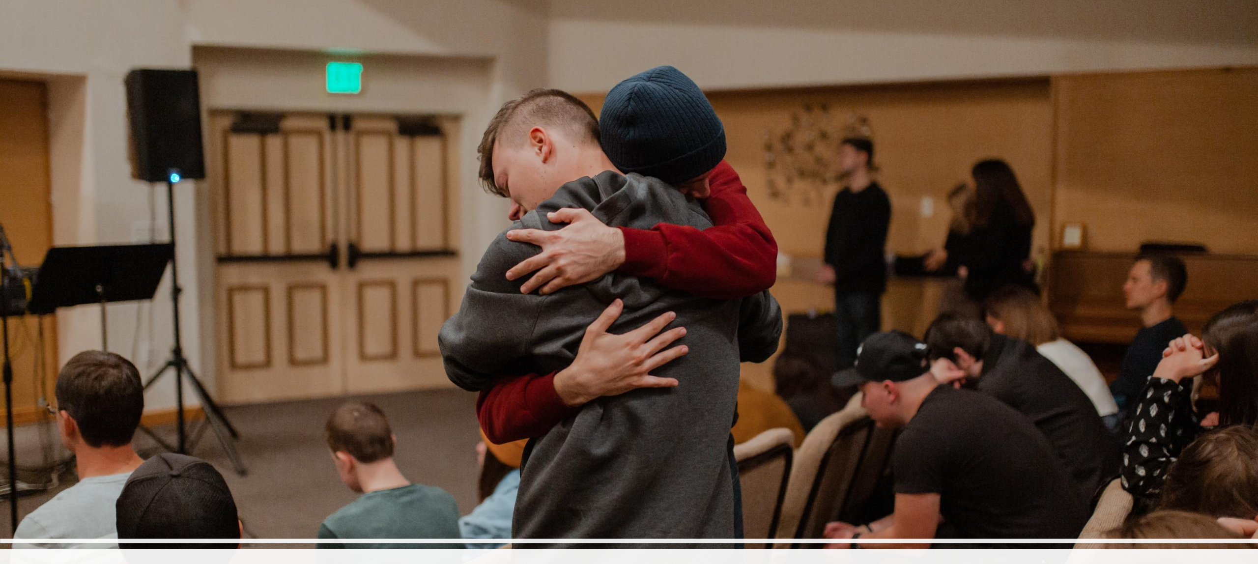
We think you cared