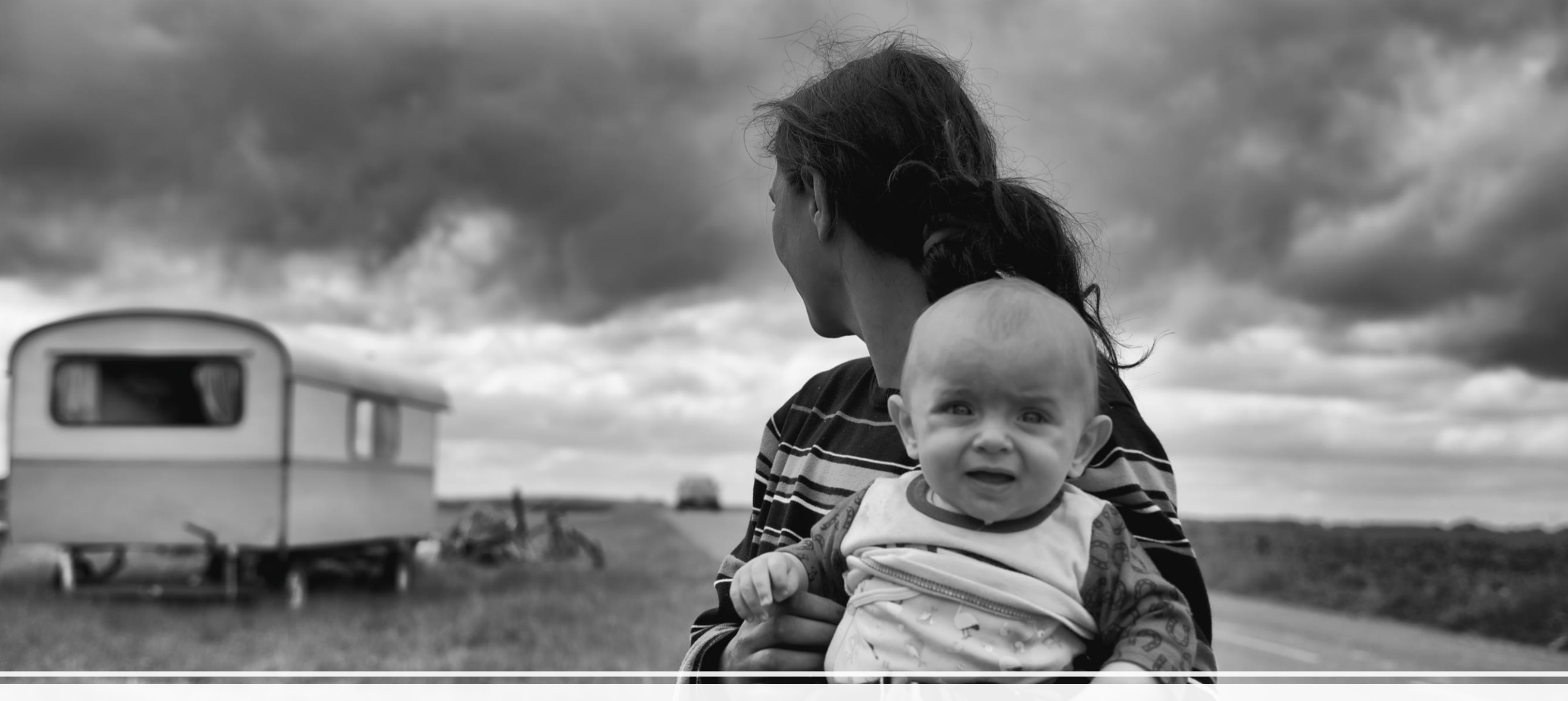
About 200 kids said that as a disaster was happening, they alerted people to get to safety because it was dangerous where they were, and 109 kids said they helped someone flee.