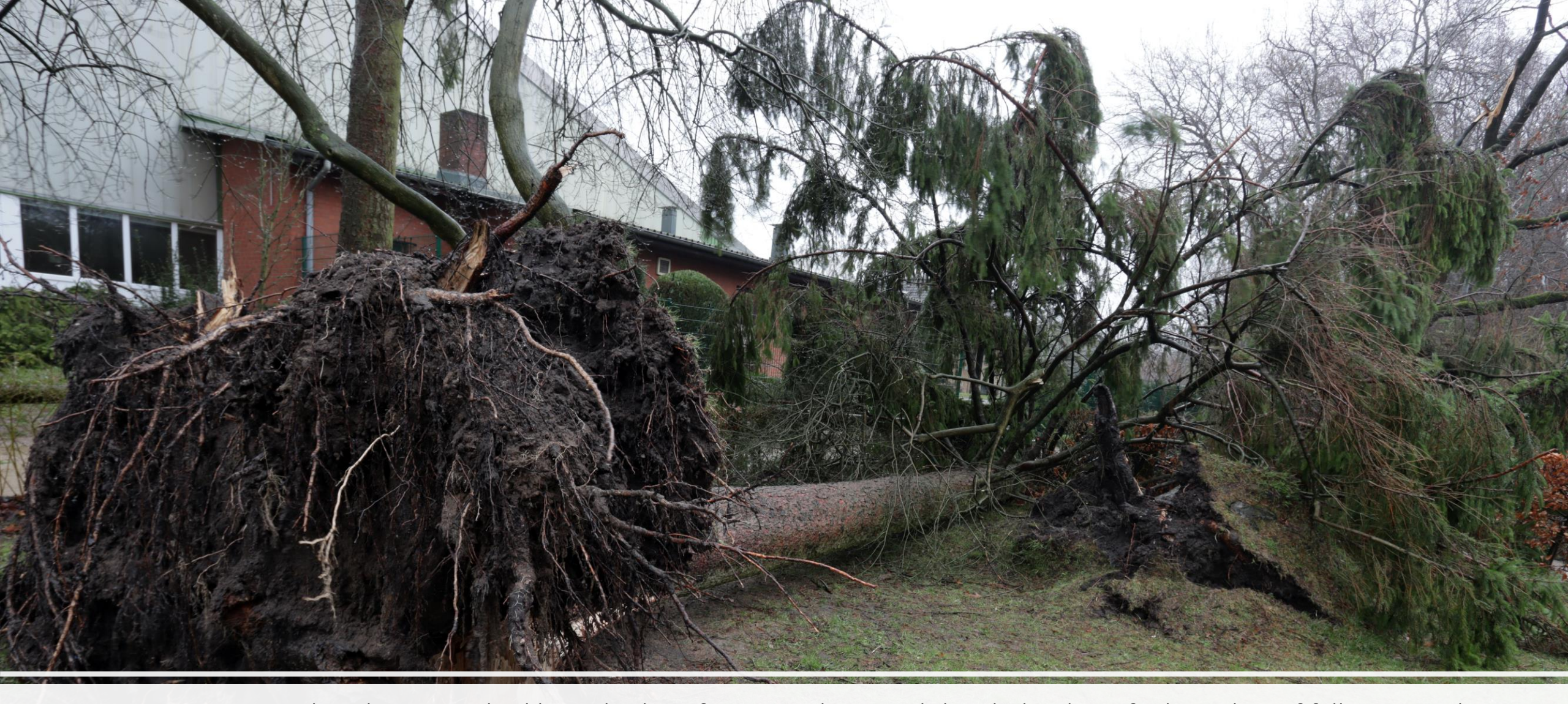
One person wrote that their town had been hit by a few tornadoes, and they helped notify the police of fallen trees that were a hazard to drivers. Someone else helped their dad put hurricane shutters onto the house.