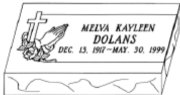
SINGLE GRASS MARKER

The simplest standard form is the flat marker or grass marker. These are one piece markers, usually four or six inches thick. Often they are two to six feet long by one wide, but may be customized. Hickey markers are taller in back then front giving the top a beveled appearance. All markers are available in any stock color on our color chart. Below are various types of markers.