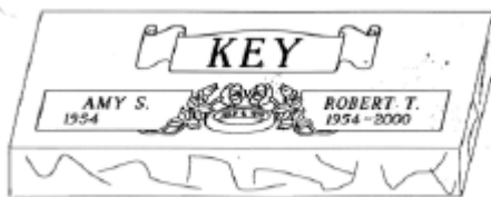
DOUBLE GRASS MARKER