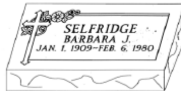
SINGLE HICKEY MARKERS