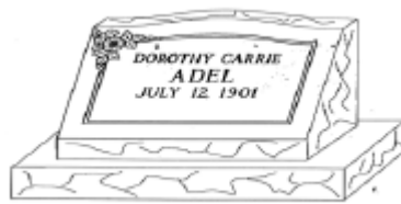
SINGLE SLANT ON BASE