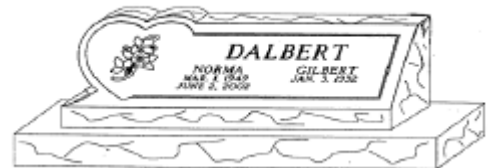
DOUBLE SLANT, HEART CUT ON BASE