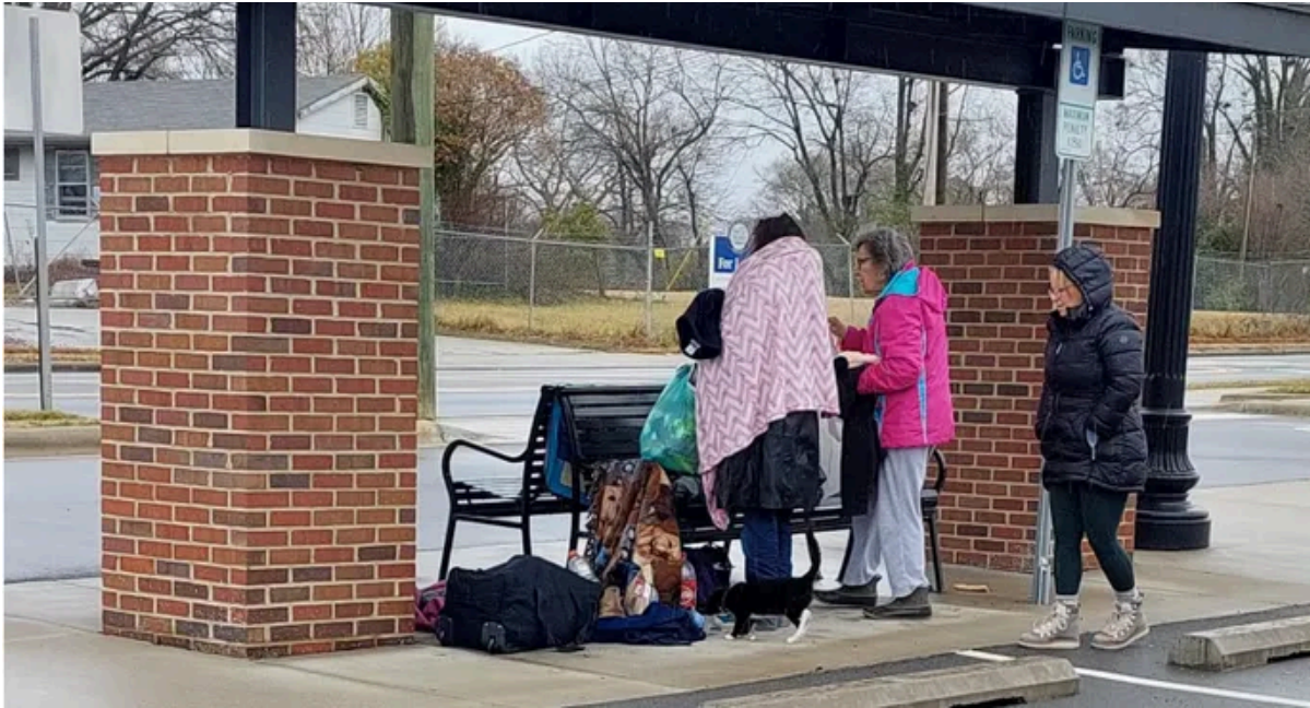
The crew warming up a soaked woman

Thanks to a donation from South Point Baptist Church in Belmont, we have received 10,396 brand-new sweatshirts, hoodies, light sweatshirts, T-shirts, long T-shirts, and jackets! Yes: 10,396. The church received the donation from a manufacturer, and Wheels of Blessings was contacted. We have shared the wealth with various churches, clothing closets, etc. Thanks to Marty and Mary of South Point Baptist Church for helping load the haul into our cars.