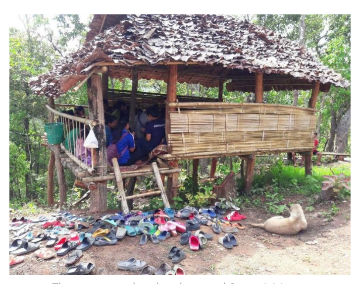
The temporary bamboo hut used for activities.