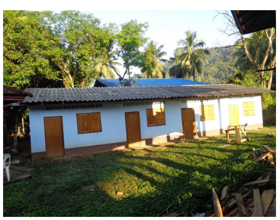
The completed learning facility at Chokloo Child Development Centre.