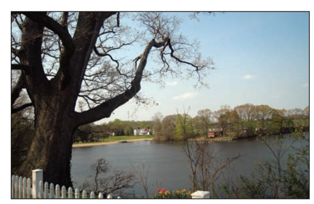
Overlooking the Wye Mill Pond

At one time a thriving smaller town, Wye Mills began a century ago to shrink into the shadows of the large, growing county seats of Easton and Centreville. Today few of the people flying down Route 50 to "reach the beach" stop into Wye Mills, and fewer still know anything of its rich history.