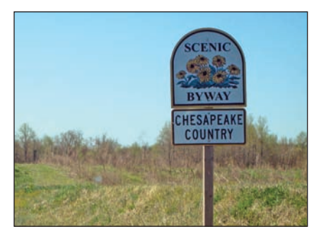
Route 213, signed here by Church Hill, is part of the Chesapeake Country National Scenic By-way.