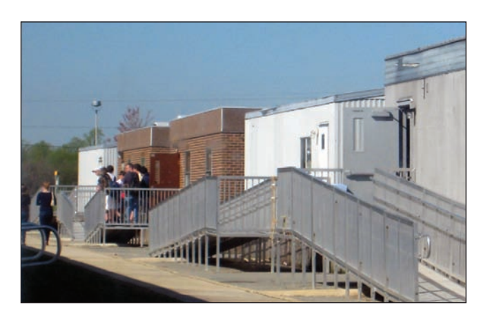
With their school over 100% capacity, students at Queen Anne's County High School have classes in trailers. Over the past decade, K - 12 student enrollment has fallen by 1 - 2% both state-wide and on the Eastern Shore as a whole. In the fastest growing counties like Queen Anne's and Frederick, however, K - 12 enrollments have risen 8% between 2000 and 2010.

All this does raise, however, the question of how far Queen Anne's County residents want "suburbanizing" to go.