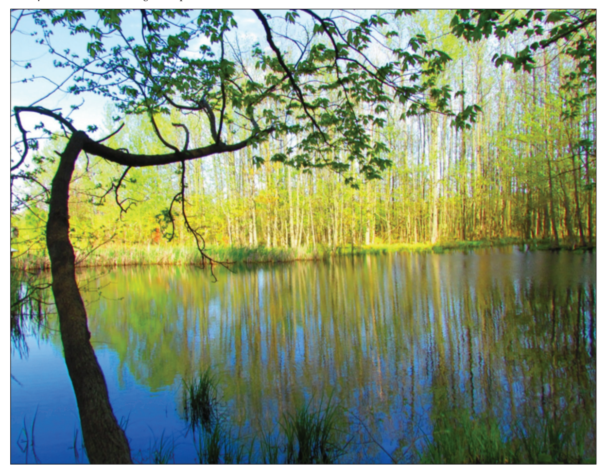
The green of spring, reflected.