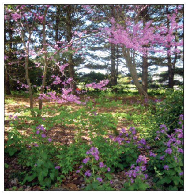
Self-sown Eastern Redbuds and Lunaria (common name: money plant, or bonesty) dot QAC's wooded areas with shades of purple in April.

• Heard one person speak at Press and Public Comment requesting withdrawal of Commissioners' support for Sunday deer hunting because of its adverse effect on wildlife watching and equine activities.