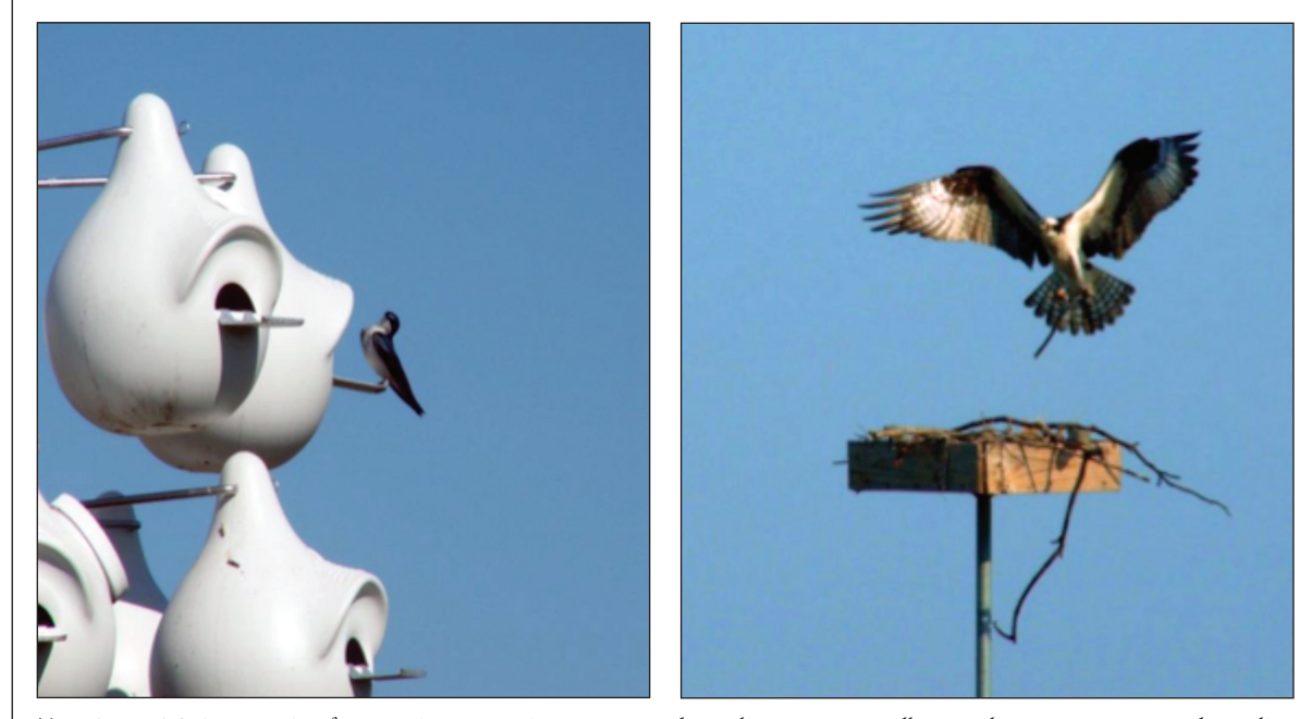
THEY'RE BACK! Returning from a winter spent in warmer southern climates, tree swallows and ospreys are among the earliest arrivals back in Queen Anne's County to begin the job of building nests and raising young. Some folks here swear that they regularly see their first osprey of the year on St. Patrick's Day. Ospreys are usually solitary migrators, very occasionally seen in small groups of four to eight. Swallows can form huge flocks that twist and turn, dipping and swirling about and constantly changing formation. Both tree swallows and ospreys readily use man-made structures for nesting, and both species are monogamous. Not happy with seeds, berries, or worms, they both are expert fliers and acrobats who catch elusive, moving meals – whether in the air or in the water.

In QAC, this maintenance work is done by the Roads Division -- part of the Department of Public Works. The Roads Division has about 40 full-time staff, a half-dozen contract staff, and over