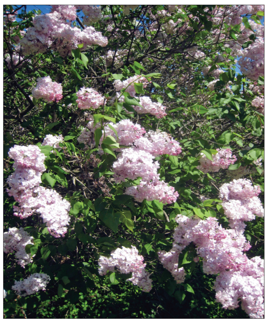
Late April is lilac time in QAC

represent its effort to promote public awareness of Maryland's rich architectural and cultural heritage. As April 27 will show, our County makes a major contribution to achieving this goal.