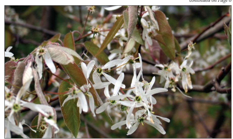
Shad tree in flower. The tree is called the "shad" tree (or bush) because it blooms as the shad begin to run in local waters. The fruit disappears quickly as it is a favorite of wildlife, especially birds. George Washington planted shad trees.

Starting with shade trees, almost all of the native oaks have high wildlife value and some, particularly the scarlet oak , Quercus coccinea , turn a lovely deep red in late fall. Elms are continued on Page 6