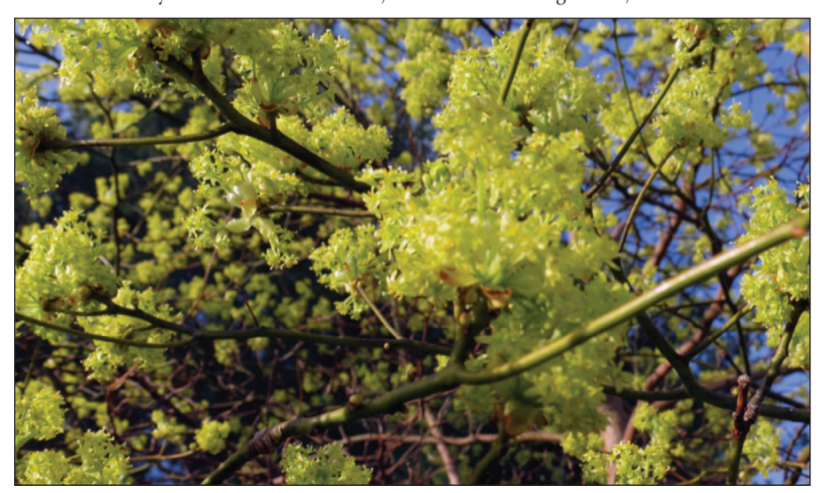
Sassafras tree in flower. Male and female flowers appear on separate trees. Just about all parts of the sassafras tree are fragrant.

While I love watching birds at my backyard feeder, I know if they are to thrive I must give them the conditions they need. That means insects, leaf litter and fruiting shrubs, as well as herbaceous