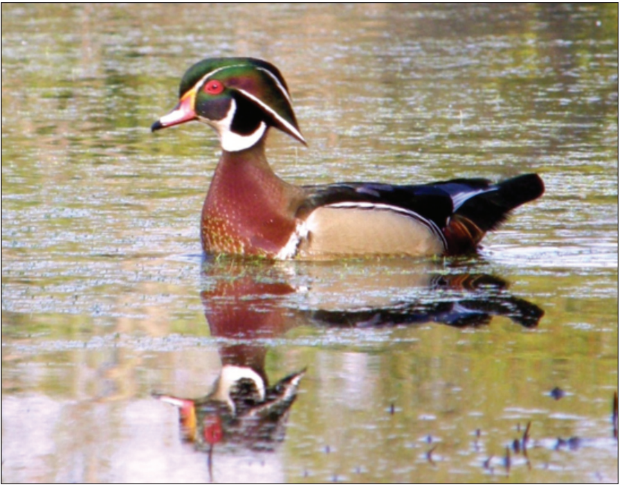
Local wood duck

Plants, like sedge, duckweed, and smartweed, comprise the largest part of the wood duck diet, but they also eat insects and small aquatic animals.