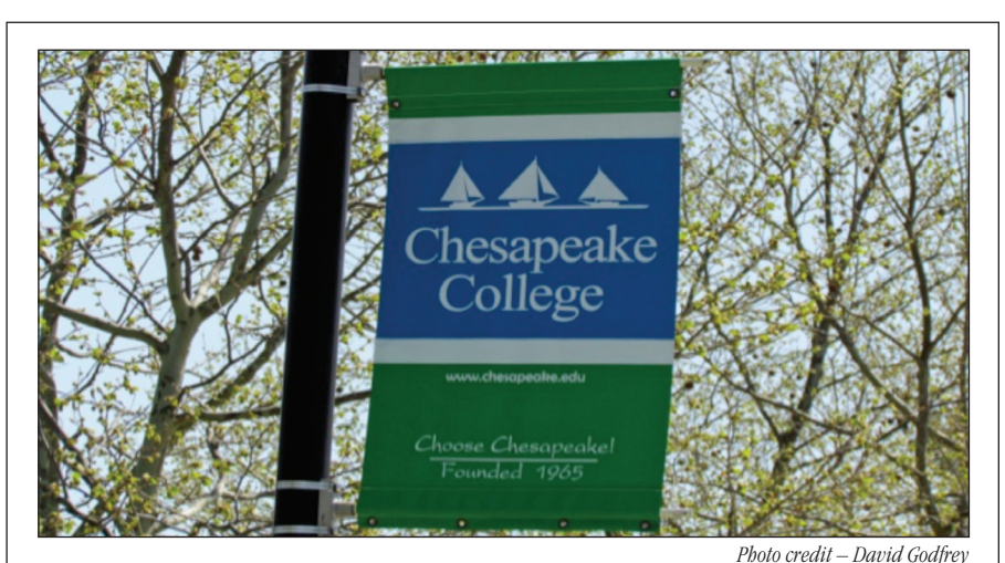
REGISTRATION INFORMATION FOR CHESAPEAKE COLLEGE

Most sadly, there are also about 200 fatalities a year from deer-caused accidents. Stay safe. Use your high beams and watch for the helpful deer-crossing signs (which, we must admit, the deer often seem to ignore). Tell visiting city-folks what's going on here and advise them to drive cautiously.