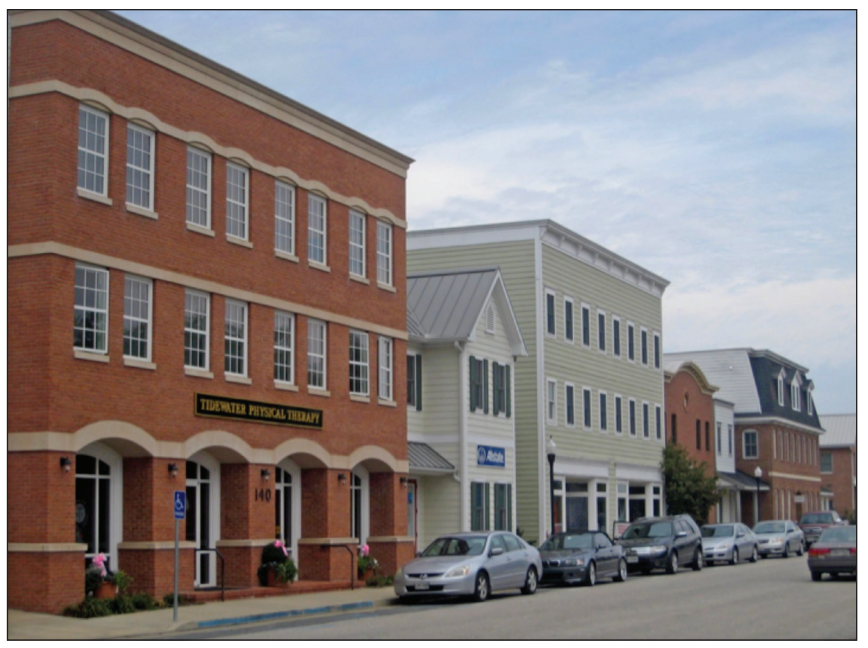
Businesses, ranging from a sewing center to offices for engineers, doctors and tax preparers, have pretty much filled one side of Pennsylvania Avenue in Centreville, with parking on the other side. Designed in the style of an Eastern Shore town, the buildings have created attractive, up-to-date commercial real estate in an in-town growth area.

But however one does or does not categorize it, agriculture is really the County's