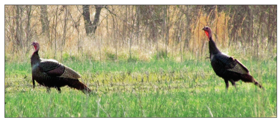
Wild Turkeys Along a QAC Wooded Edge. Wild turkeys roam over a range of 4 to 5 square miles (2560 to 3200 acres) during summer and fall. During winter and spring, their range is much more limited, covering only about 100-200 acres. The young emerge from the egg quite well-developed and are able to leave the nest and find food within 12 to 24 hours of hatching.

Of course, in Franklin's day, the wild turkey was abundant here, as well as in most of the Northeast. It had been the principal game bird of Native Americans, although it is said that certain tribes spurned them, because they thought that eating them would make them as cowardly and silly as the birds! Nevertheless, the European settlers loved them, and with no restrictions on the numbers that could be taken, it wasn't long before professional market gunners were slaughtering turkeys by the thousands to sell to the growing cities of Philadelphia and Baltimore. At the same time the woods were being razed for firewood, lumber and charcoal. Under such conditions, it is hardly surprising that, by the mid 1800s, there were precious few turkeys left in Maryland.