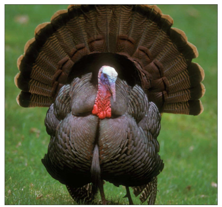
The Courtship Display of a Male Wild Turkey. The male's gobble as he broadcasts his presence to female turkeys can be beard as far away as a mile. He makes other sounds to announce bimself as well. An air sack in his chest allows him to make a low-pitched drumming or booming sound; by sharply releasing the air in the sack, he can make a spitting sound. In turn, the females, or hens, let the gobblers know their location by "yelping."

Now they seem to be everywhere. Last July, I was walking in the woods, when I came upon a female crouched in the middle of the path. I was wondering why she didn't move until she suddenly jumped up and came at me, squawking and flapping as several poults (that's what you call young turkeys) scattered in all directions! She had been sheltering them under her wings. Another time I was driving down a wooded road when a huge dark bird flew right over the hood of my car, nearly causing me to run into the ditch. After I caught my breath and calmed my nerves, I knew it had to have been a wild turkey. No other bird is quite that massive.