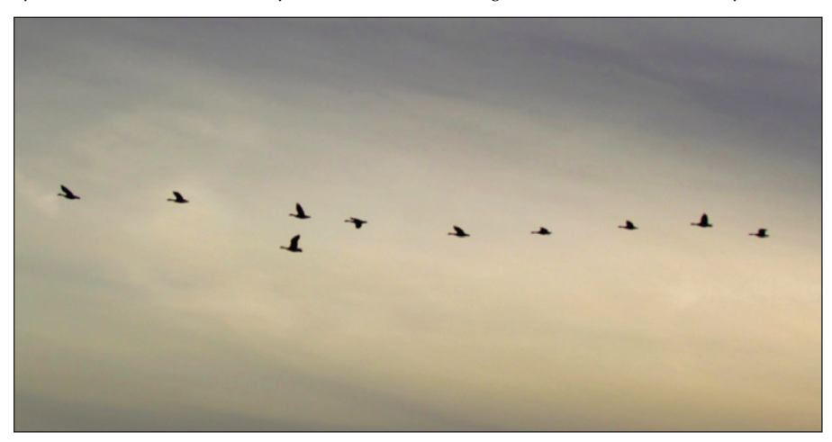
Normal migration altitude for Canada geese is 3,000 feet, but they have been observed flying as high as 29,000 feet.

If they are lucky that may be as long as twenty-five years, although like most wild creatures, geese live a dangerous life. The eggs are eaten by a number of animals from raccoons to snapping turtles, the goslings often fall prey to hungry owls and eagles, while the adult birds are preyed upon by animals such as foxes and coyotes. That is not counting the numbers that are shot by hunters.