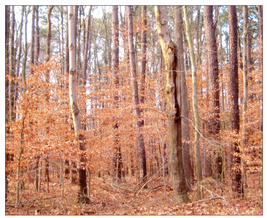
Young beech trees in woods near Centreville

Now is the time of year when the beech trees stand out in our woods. Unlike so many deciduous forest trees, the beeches ( fagus grandifolia ) hold on to their leaves — often until spring. As winter comes on, their leaves turn from the bronze of fall to a papery yellow-tan that responds to the winter sun, seeming to decorate the trees and attracting the attention of those who pass by.