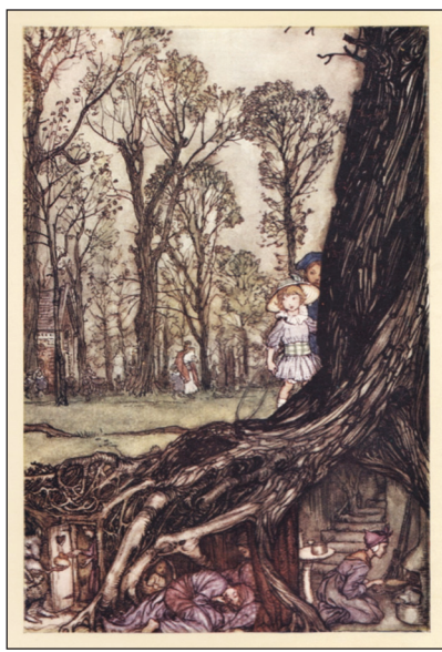
- Arthur Rackham, 1906

Now's the time of year to admire our native beech trees as they make themselves known in the winter woods.