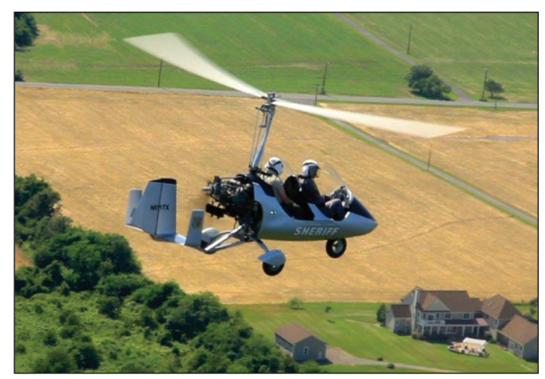
Gyrocopter in Flight

Nevertheless, in our fallen world, QAC is a great place to live — just go back to the beginning of this article and look again at our major crime statistics. They are very hard to beat, and as a community we should be proud of that.