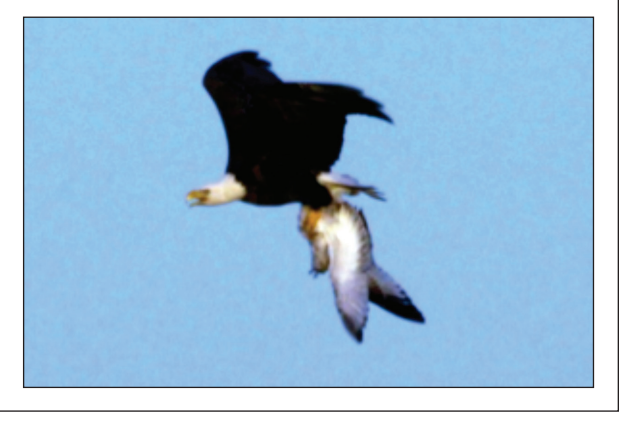
Eagle in flight with prey bird over Reed Creek