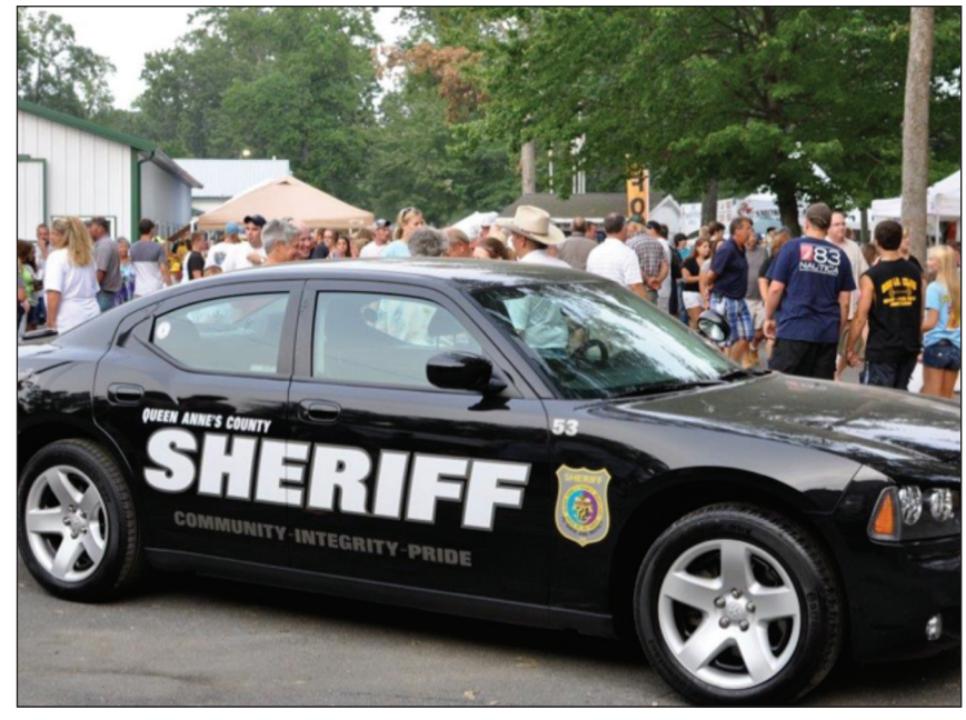
At the County Fair

Let's look at the crime data (for 2012 except as noted).