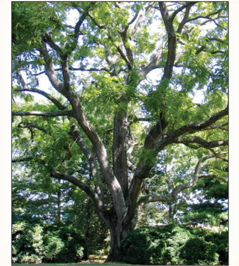
Old Black Walnut Tree in Centreville

"[E]xcessive animal crowding has favored the