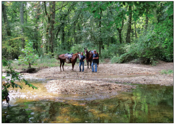
Trail Riding in QAC

valuable part of what, as recognized in our Comprehensive Plan, is our "quintessential rural community".