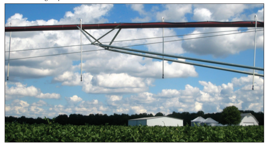
Growing corn in QAC

According to Russ Brinsfield, Director of the Wye Research and Education Center, most of the public varieties of soybeans were developed at WREC. ("Public" varieties are ones developed by land grant institutions using taxpayer funds to develop varieties for the public good.) Scientists and researchers here look for and breed plants for resistance to a variety of diseases without lowering crop yield. They have developed most public varieties of soybeans with a high oil content particularly good for chickens and frying. And they study to see how much and at what rates different chemicals present in pesticides and herbicides carry over into the crops they are applied to and how long they remain in the soil.