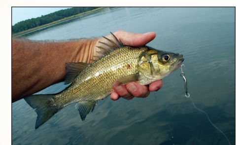
Fresh gills, full bright eyes, moist fins and tail

Fish Deceits "Every species generally of salt water fish are best fresh from the water, tho' the Hannah Hill, Black Fish, Lobster, Oyster, Flounder, Bass, Cod, Haddock and Eel, with many others, may be transported by land many miles, find a good market, and retain a good relish; but as generally, live ones are bought first, deceits are used to give them a freshness of appearance, such as peppering the gills, wetting the fins and tails, and even painting the gills, or wetting with animal