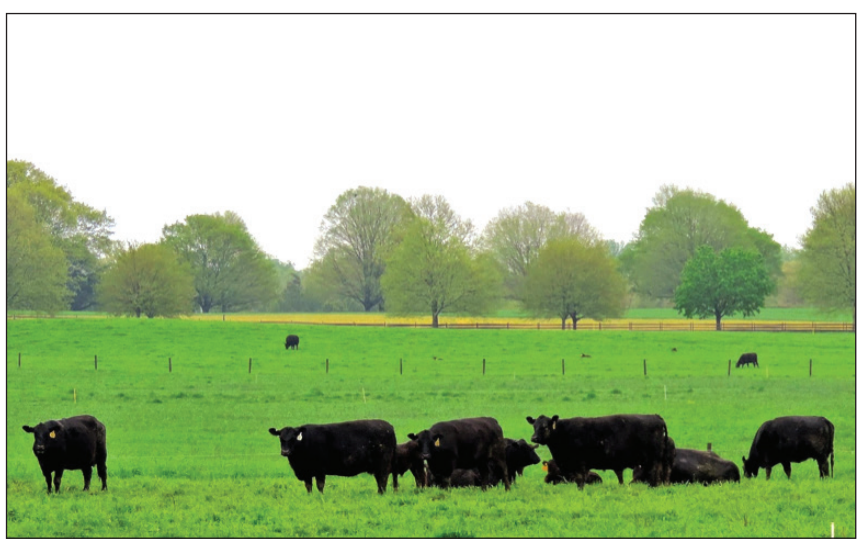
Black angus cattle in the fields of Wye Research and Education Center