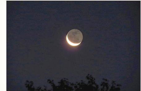
The new moon in the old moon's arms

The Naming of Full Moons. Algonquin tribes gave a name to each full moon and used the name to designate the whole month in which the full moon occurred. The early settlers adopted many of these names and invented some of their own. "July [12]: The Buck Moon — Buck deer start growing velvety hair-covered antlers in July. Frequent thunderstorms ... also resulted in the name Thunder Moon... August [10]: The Sturgeon Moon — The sturgeon