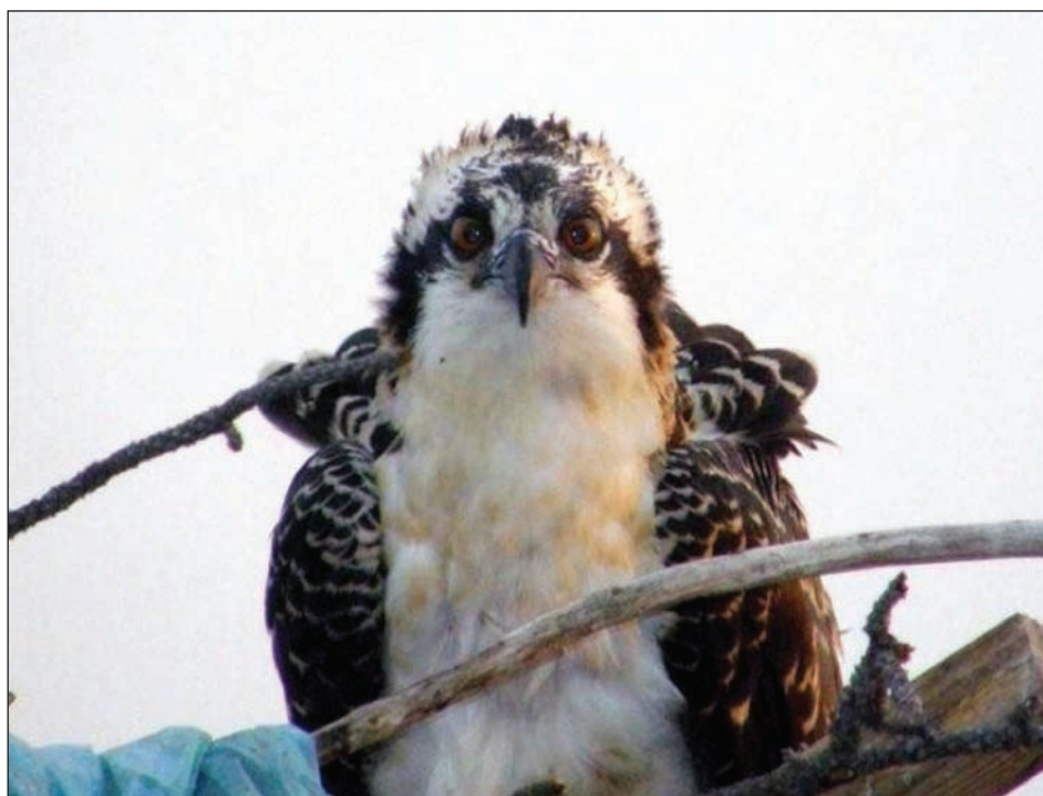
Up close to a QAC spring and summer resident. An osprey looks out from the nest.