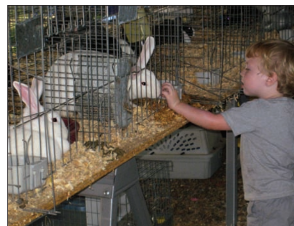
Getting acquainted with domestic animals during the first of many visits to the Queen Anne's County Fair.

In the twenty-first century, then, the beginning of August still announces a special time for celebration and relaxation. Let's go to the Fair!