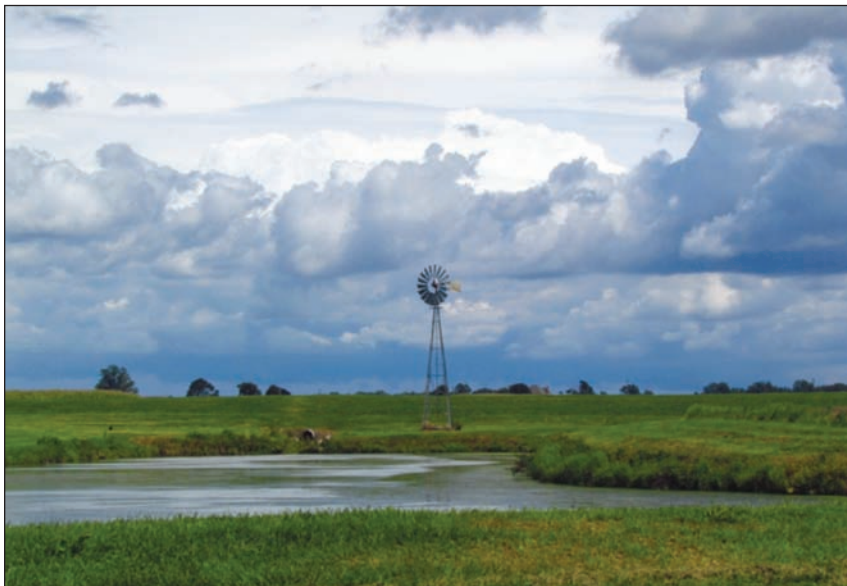
QAC Summer Skyscape