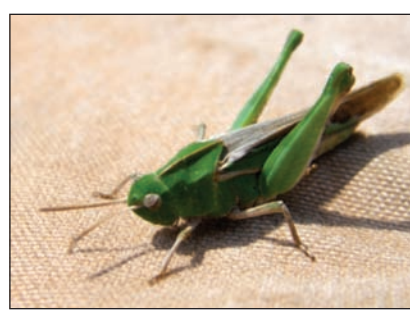
Such small creatures and such a loud noise! Late summer noise makers, a katydid, right, and, left, a cicada. This cicada’s popular name is “Dogday Harvestfly” because it is heard and seen during the hot “Dog Days” of late summer.