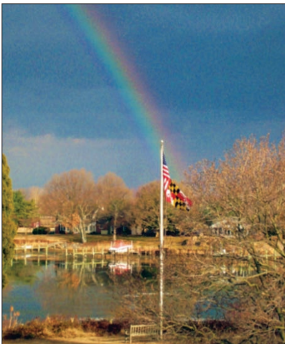
Rainbow over Grove Creek

Lacking (as discussed above) any up-to-date data for QAC, we went to the Maryland Climatologist's data for Baltimore,