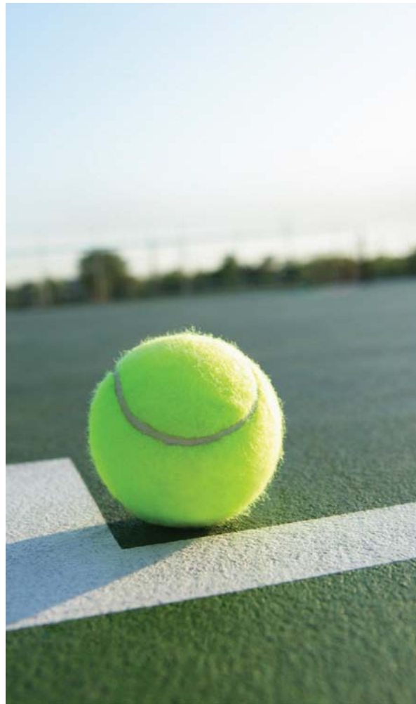
Sports facilities with Tennis Courts, Half court basketball, Table tennis & Badminton courts