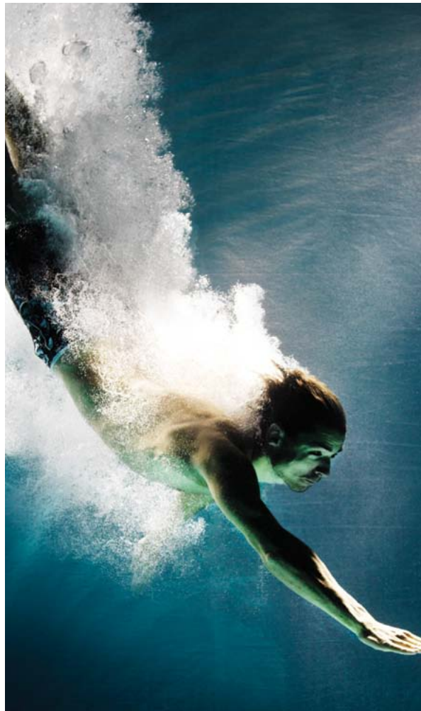
Expansive. L - shaped pool & kids' pool.