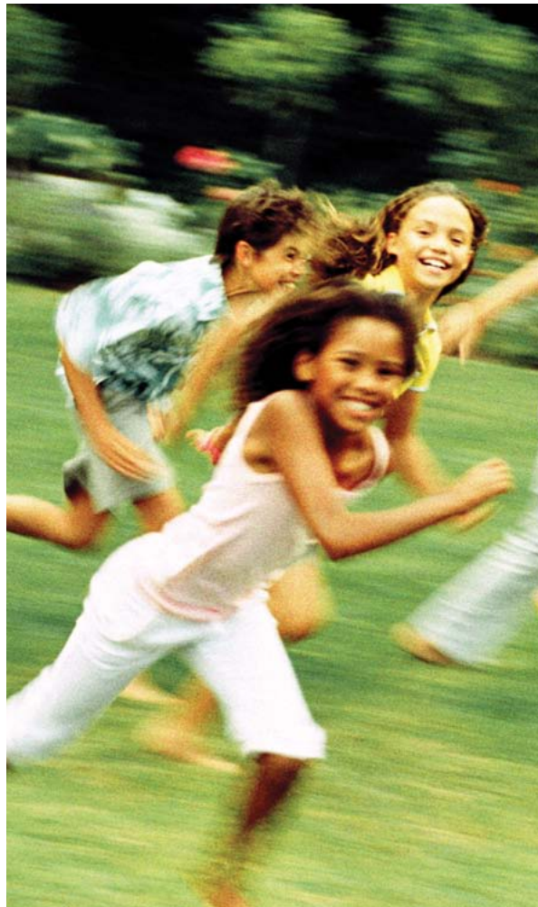
Children's play area