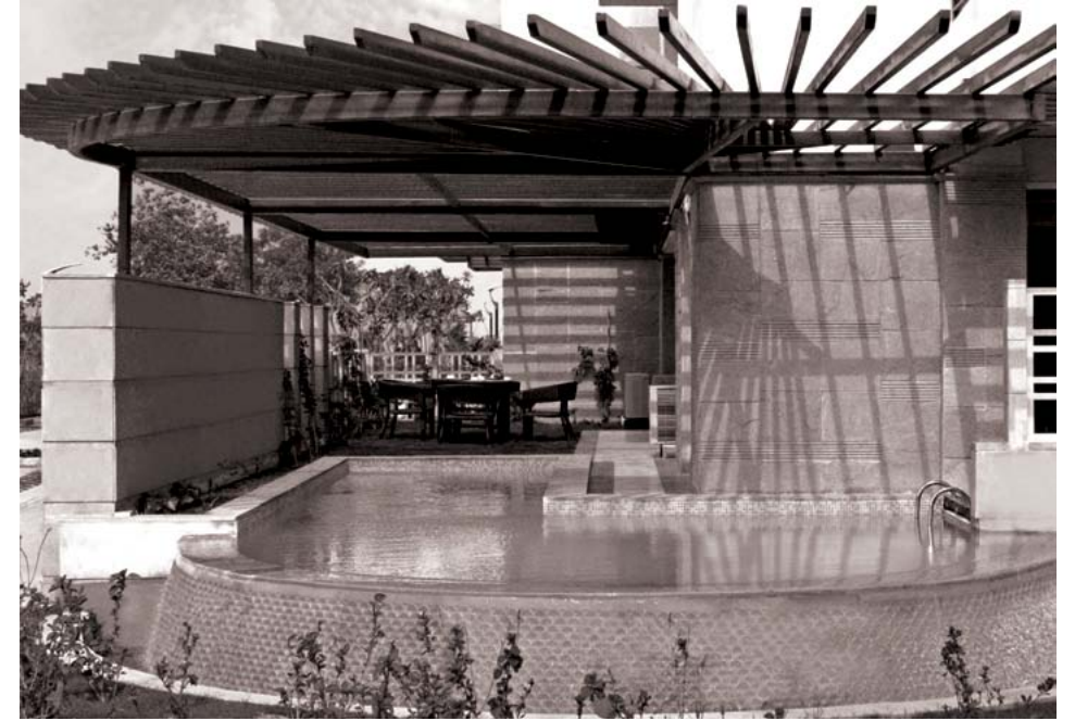
THE PRANAYAM, FARIDABAD