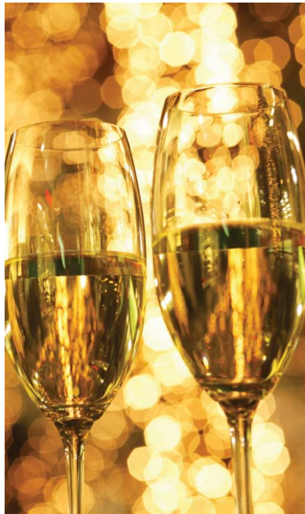
Club with lounge, Recreation room, Multi Community hall / function lounge