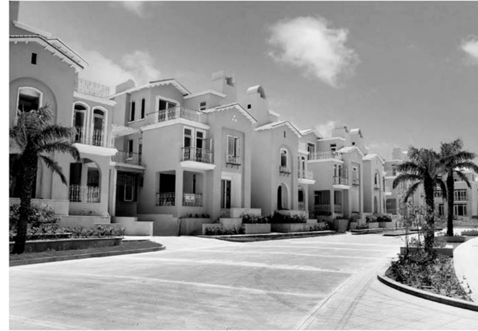
THE PALM SPRINGS, GURGAON

With a dedicated and efficient team, we create spaces which offer the best of features within record time. This has made us one of the fastest growing and the most respected real estate companies. The Palm Springs, Palm Springs Plaza, Pranayam, Pratham, VIP Floors and 81 High Street are projects that have set new benchmarks in both design and execution.