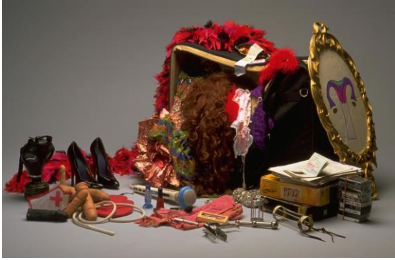
Props and suitcase