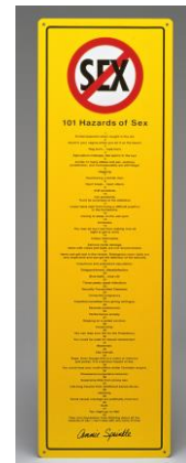
101 Hazards of Sex