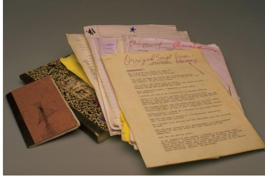
Scripts and Notebooks