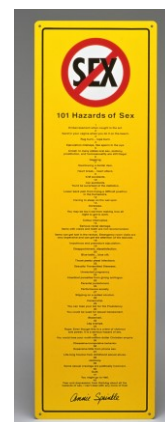
101 Hazards of Sex