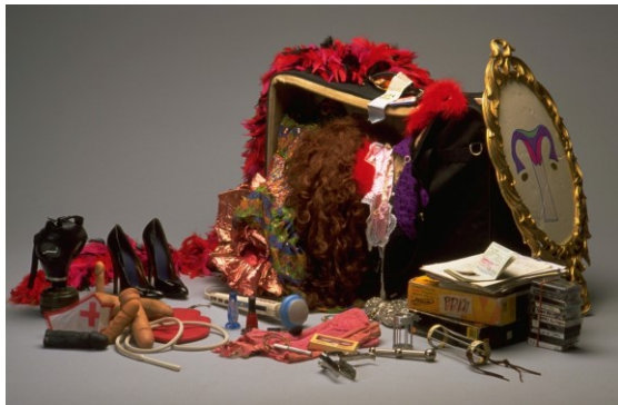
Props and suitcase