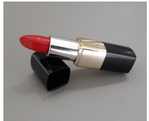
Janine Antoni, Viewers Red , 1993