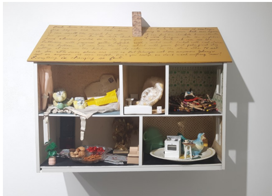
Karen Finley, Dollhouse: Back Home , 1994