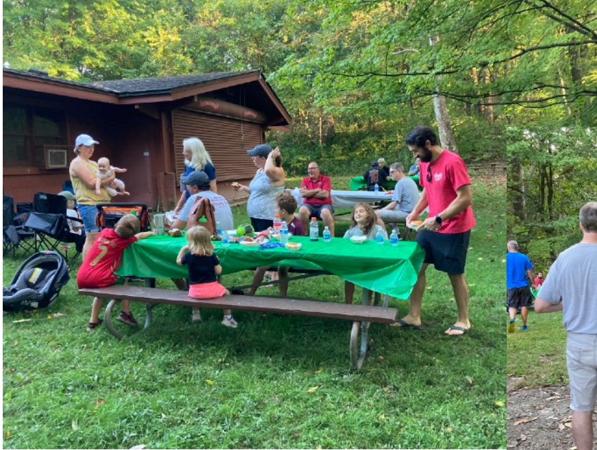
Fall Cookout New Neighbor Welcome