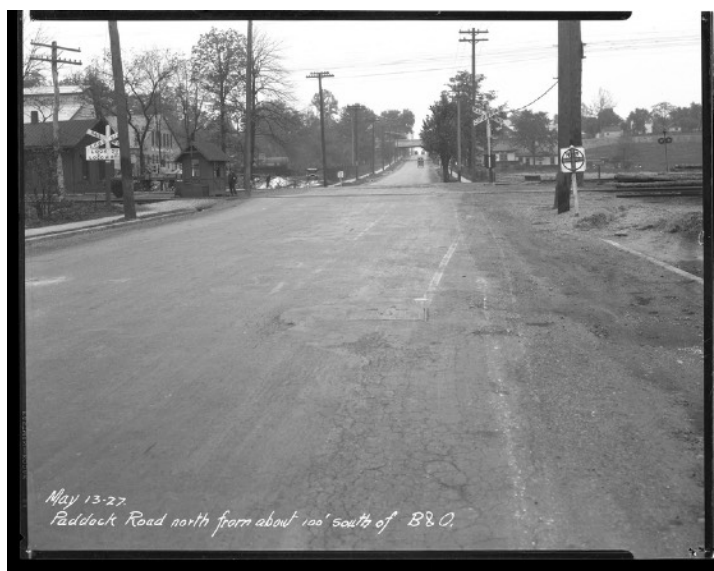
Paddock Road May 13, 1927

The first homes were built on Paddock Hills Avenue in 1919 as a development that was seen as a logical extension of North Avondale to ring the Avon Field golf course. Some five years later a developer purchased the remaining woods and farmland of our hill and carved out Avon Drive, Westminster and it's cul-de-sacs, much to the chagrin of the original Paddock Ave. residents who sued unsuccessfully to try to block the development. Originally the neighborhood was marketed as Avondale Heights. It's unclear when the Paddock Hills moniker took hold, likely in the '50s.