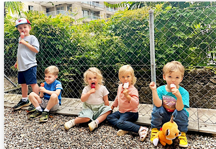
Ice Lollies on a Hot (Dog) Day ☺

Come and join us in the garden for fun and fellowship, no need to RSVP