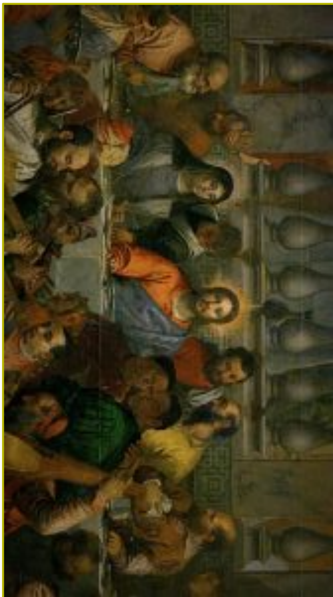
Veronese: The Marriage at Cana

Do stay for refreshments and fellowship after the service today and please take your pew sheet home with you 😊