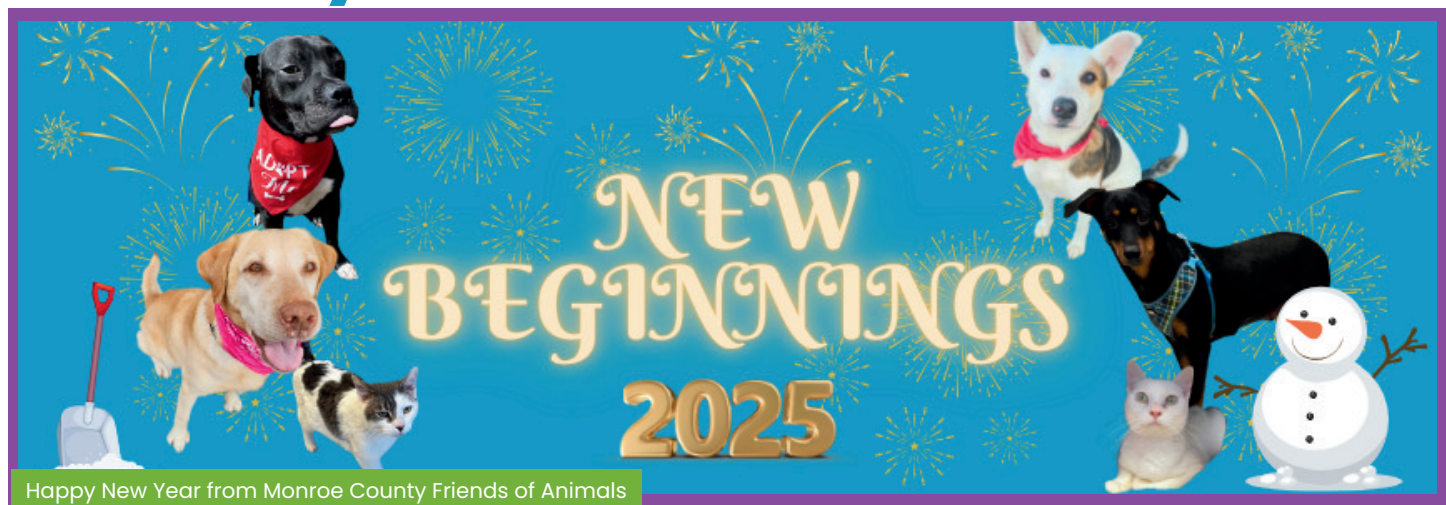
Happy New Year from Monroe County Friends of Animals