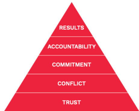
The Five Behaviors Model

The experience is completed through a one day training session, led by a trained Five Behaviors expert. This session includes a walkthrough of the Personal Development profile, breakout activities, and group discussion.