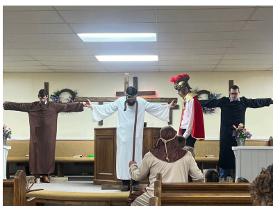
Easter skit "Watch the Lamb"