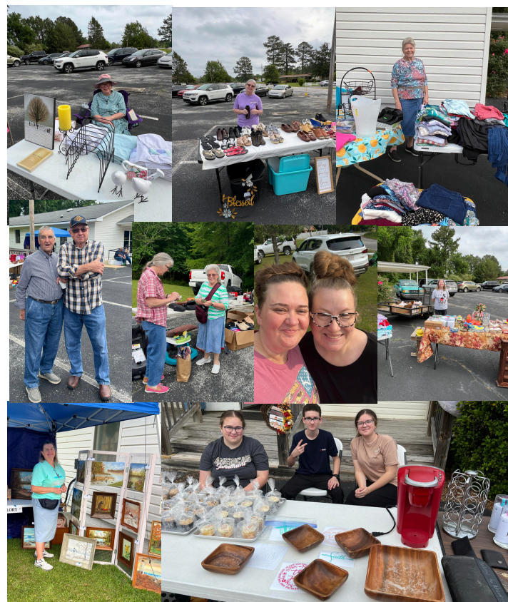
On April 27 a arts, craft, and yard sale was held at Eastside.