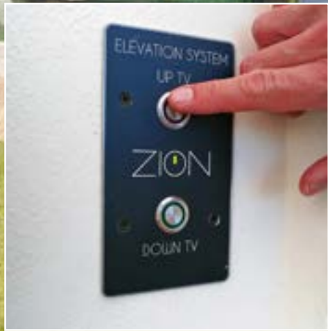
Remote control that allows easy and safe operation of the lift system.