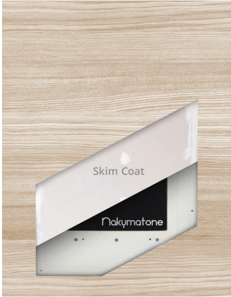
Wood Veneer Finish