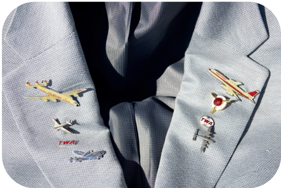
My lapel pins of the planes that Capt. Neumann flew.