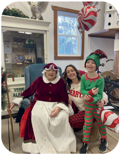
Mrs. Clause flew in on Mr. Mulligan to collect letters to Santa from all the kiddos. It was a fun afternoon of treats and hearing all the kids Christmas wishes.