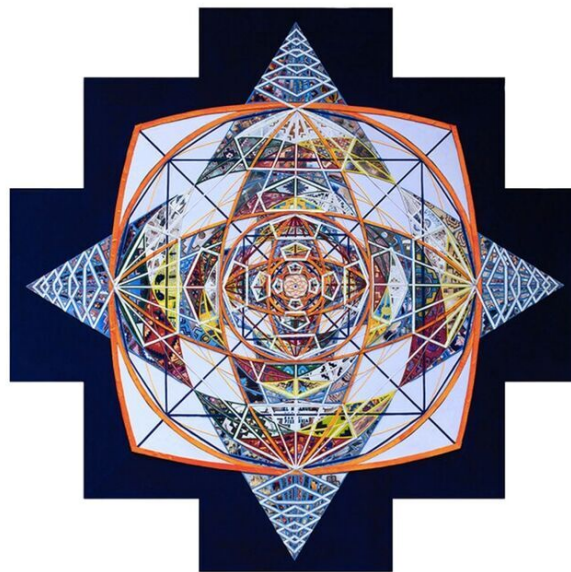
Tunnel Vision, Eye of Eternity Photo Collage - Learn More Click on picture