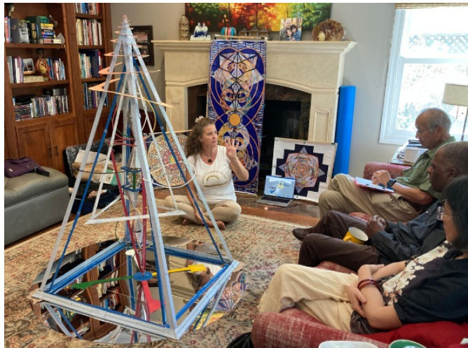
The Magicians Jewel Model - A Conscious Installation Device - To learn more click on the picture