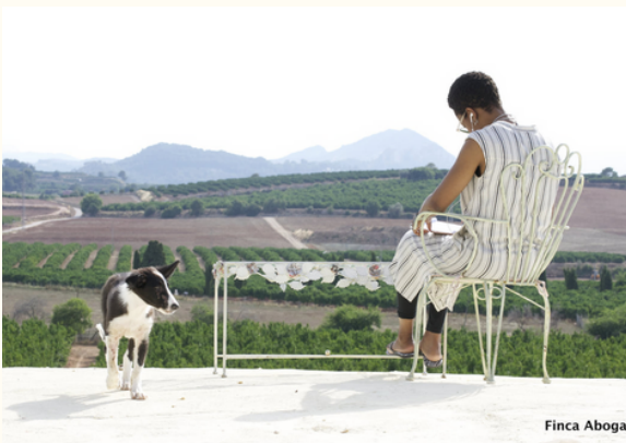
View From Infinity Villa

Infinity Villa has gorgeous views, especially during the sunset which is breathtaking every evening. You will be able to enjoy the infinity pool, sunbathing area, outside dining, and a beautiful rustic inside setting.