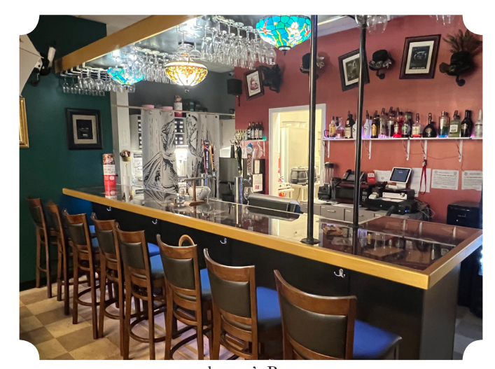
hatter's Bar Up to 80 guests in restaurant 250 at event center.

The Perky Ketter is a unique decidedly British themed venue offering two "rooms" and a large event space for your special event. Choose from our turn of the century inspired Travel Exploration and Adventure (T.E.A.) Society space, our fanciful Alice in Wonderland Indoor Patio or our formal event space. We can handle groups up to 80 in the main restaurant and up to 250 in the event space. The Perky Kettle is happy to offer brunch, lunch and dinner events.