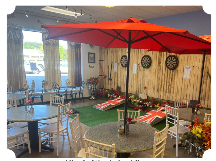
Alice In Wonderland Room Up to 80 guests in restaurant 250 at event center.

The Perky Ketter is a unique decidedly British themed venue offering two "rooms" and a large event space for your special event. Choose from our turn of the century inspired Travel Exploration and Adventure (T.E.A.) Society space, our fanciful Alice in Wonderland Indoor Patio or our formal event space. We can handle groups up to 80 in the main restaurant and up to 250 in the event space. The Perky Kettle is happy to offer brunch, lunch and dinner events.