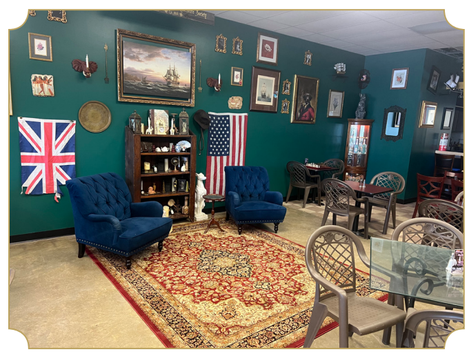
\begin{tabular}{ll} T.E.A. Society Room \\ . Up to 80 guests in restaurant 250 at event center. \\ \end{tabular}