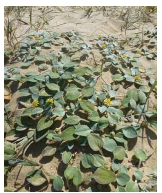
Cooks Crescent cleanup BEFORE