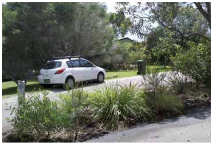
Cooks Crescent cleanup AFTER