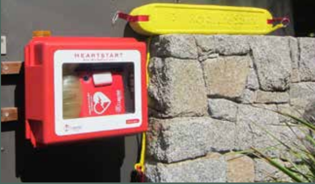
Defibrillator, rescue tube and first aid kit are behind the Cabins