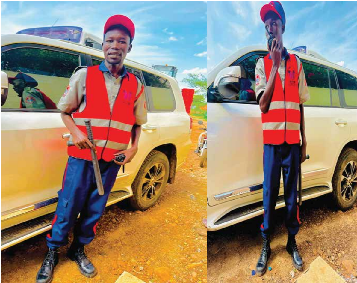
Garden City Hotel Security Officers