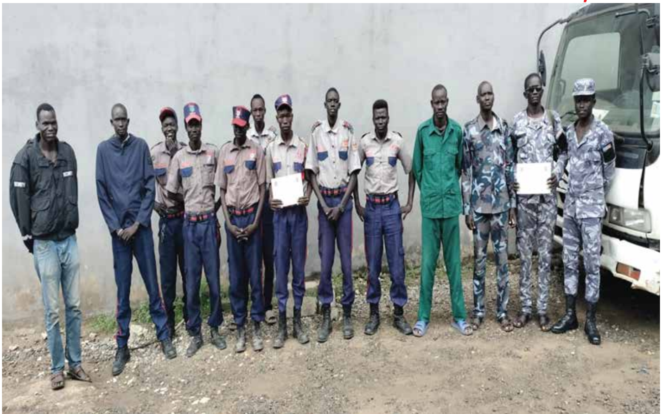
Awarded 2023 at SICO BLOCKS FACTORY