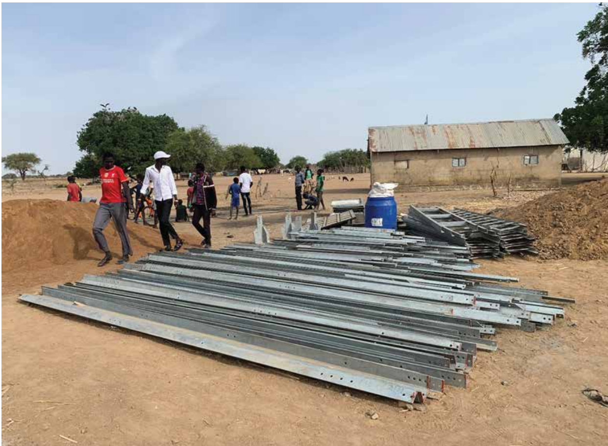
Figure 6 OFF SITE EQUIPMENT PROTECTION IN WARRAP STATE, TONJ NORTH COUNTY