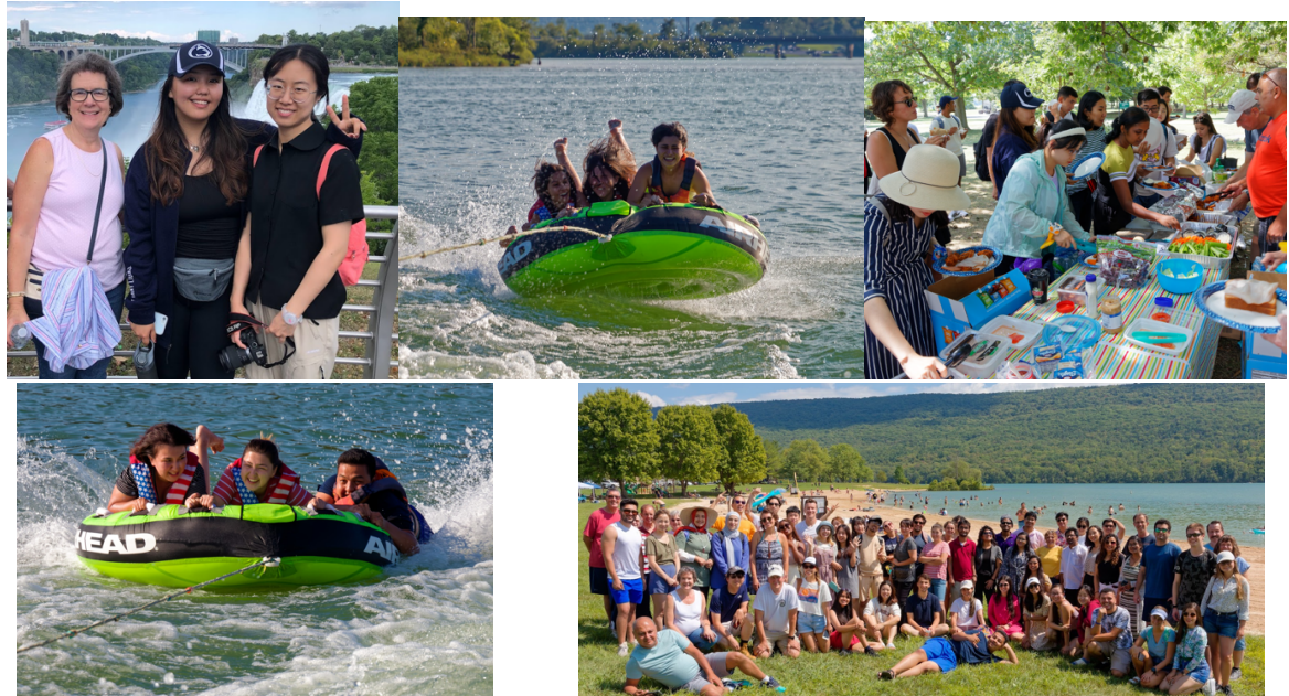
Pictures of our group at both Niagara Falls (top) and Bald Eagle State Park (bottom) On the home front – continued from last month!