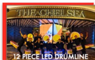
12 PIECE LED DRUMLINE 20'X32' Unobstructed Space* 6 Snare Drummers 2 Tenor Drummers 4 Bass Drummers