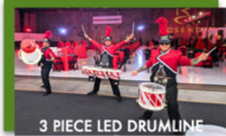
3 PIECE LED DRUMLINE 12'X16' Unobstructed Space* 1 Snare Drummer 1 Tenor Drummer 1 Bass Drummer

*For Maximum Visual Impact, and Performer Safety, the Performance Space should be clear of Obstructions (Lecterns, Furniture, Plants, etc...) Obstructions or Limited Space may result in Modification/Simplification of Choreography, potentially Diminishing Visual Impact.