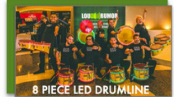
8 PIECE LED DRUMLINE 16'X24' Unobstructed Space* 4 Snare Drummers 2 Tenor Drummers 2 Bass Drummers