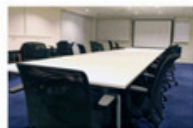
Greenroom with Table & Chairs