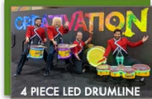
4 PIECE LED DRUMLINE 12'X16' Unobstructed Space* 2 Snare Drummers 1 Tenor Drummer 1 Bass Drummer