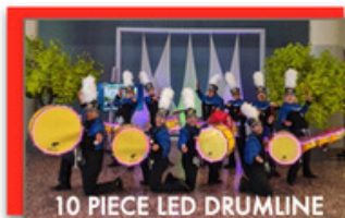
10 PIECE LED DRUMLINE 20'X28' Unobstructed Space* 4 Snare Drummers 2 Tenor Drummers 4 Bass Drummers