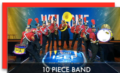
20'X28' Unobstructed Space*