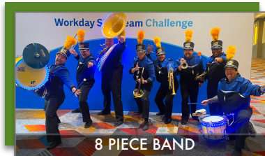
16'X24' Unobstructed Space*