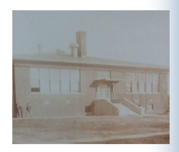
Original Wayne City Grade School built 1930

The Wayne City Archives committee members believe that historical items, trophies, photos, championship banners and awards are important to memorialize achievements of the past and to point to the future. They hope that young people who view the items will be inspired to set their own goals of greatness.