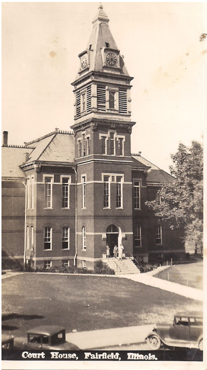
Court House, Fairfield, Illinois.