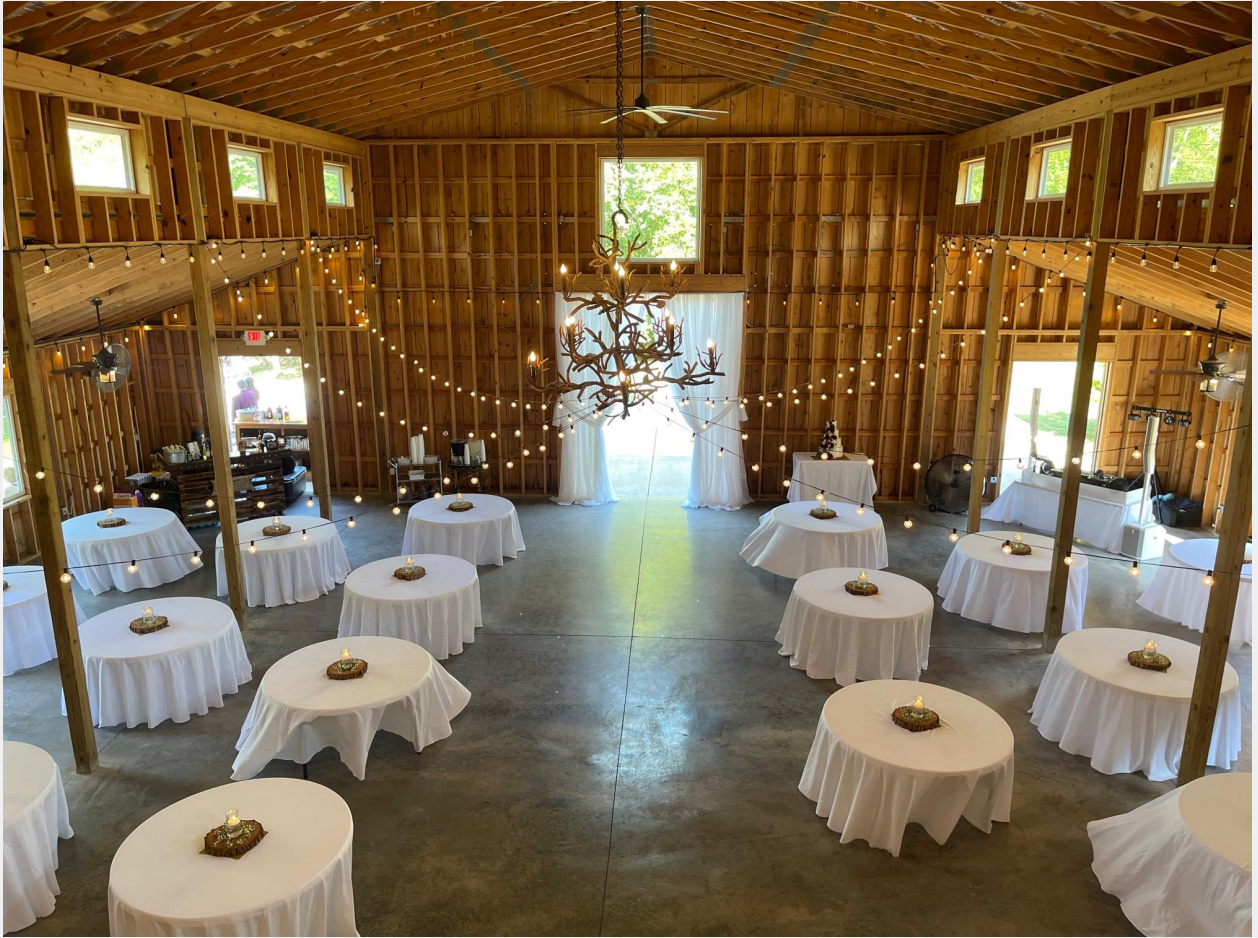
Table Setup service - $ 250

This service will provide a complete set up for all your tables inside the barn according to the layout you provide to us. This is generally done the night before or prior to your arrival on the day of your event. We will also have all the tablecloths neatly placed on top if you rent from us or if you bring them to us in advance. This service will also include placement of the furniture available inside the barn. Chairs, big cross and arch/arbor will likely be pushed close to the big barn door unless otherwise instructed. Help with the layout is included.