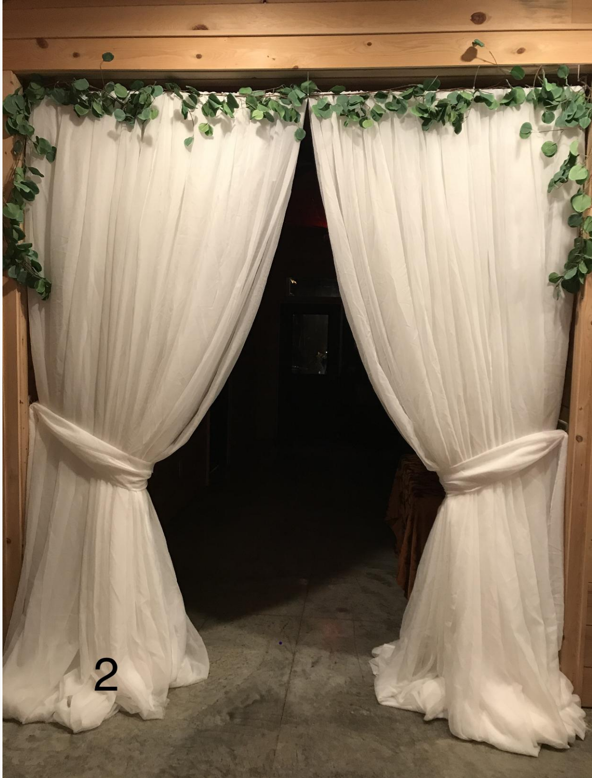
Hallway draping - $ 100 Greenery is not provided.