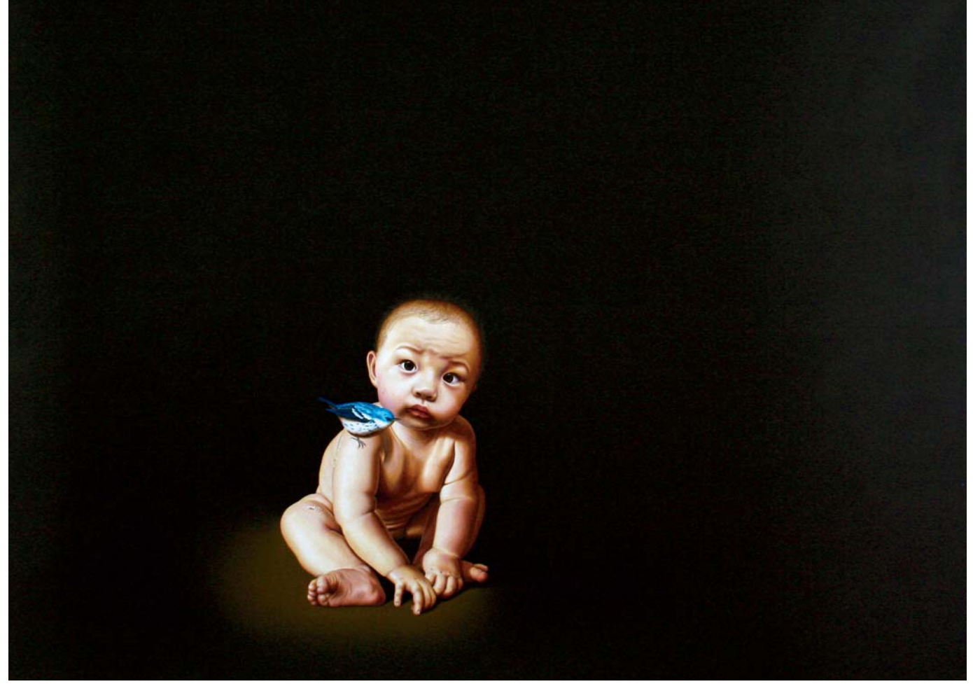
Cerulean Warbler, oil on canvas, 36 x 48"