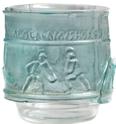
Glass sports cup

A British Museum Partnership Exhibition Gladiators of Britain will be on display at Dorset Museum & Art Gallery, Dorchester (25 January – 11 May 2025); Northampton Museum & Art Gallery (24 May – 7 September 2025); Grosvenor Museum, Chester (20 September 2025 – 25 January 2026); and Tullie House Museum & Art Gallery, Carlisle (7 February – 19 April 2026).