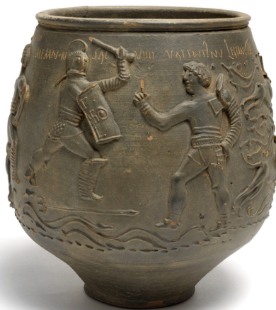
Colchester Vase