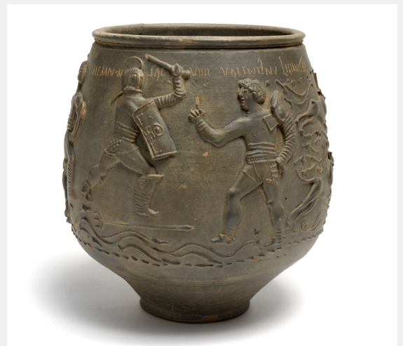
Colchester Vase