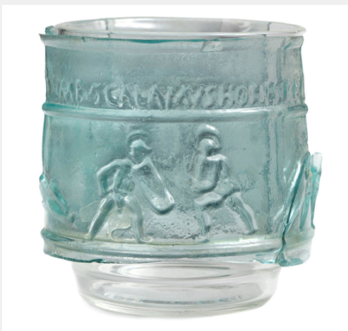
Glass sports cup

A British Museum Partnership Exhibition Gladiators of Britain will be on display at Dorset Museum & Art Gallery, Dorchester (25 January – 11 May 2025); Northampton Museum & Art Gallery (24 May – 7 September 2025); Grosvenor Museum, Chester (20 September 2025 – 25 January 2026); and Tullie House Museum & Art Gallery, Carlisle (7 February – 19 April 2026).