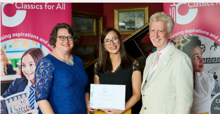
Primary School of the Year: Greyfriars Academy

Christ Pilcher Award: The Hemel Hempstead School