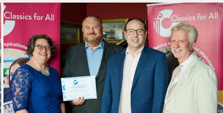
Sixth Form College of the Year: Thomas Rotherham College