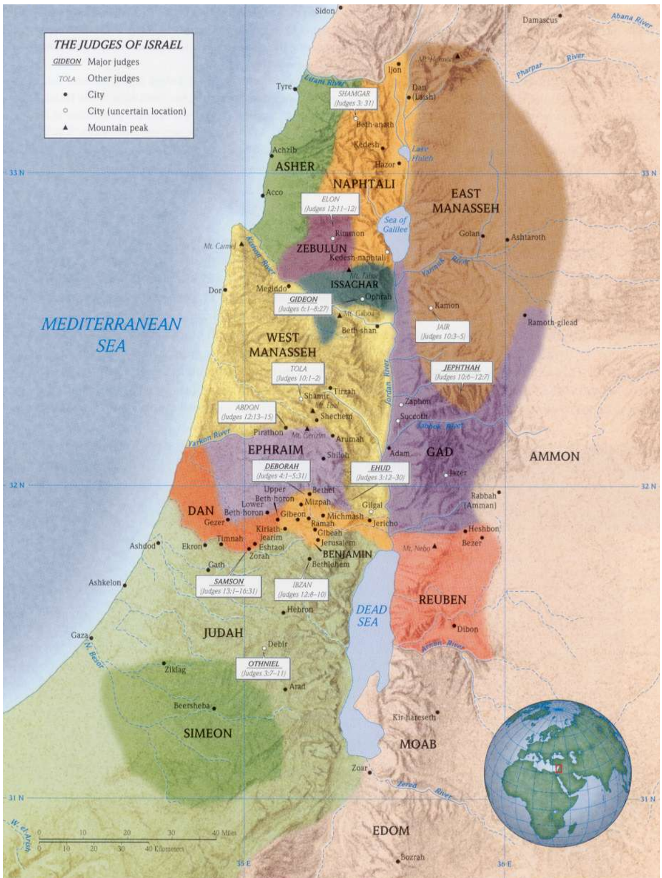
Figure 1: The nation of Israel with their tribal land allotments during the time of the judges