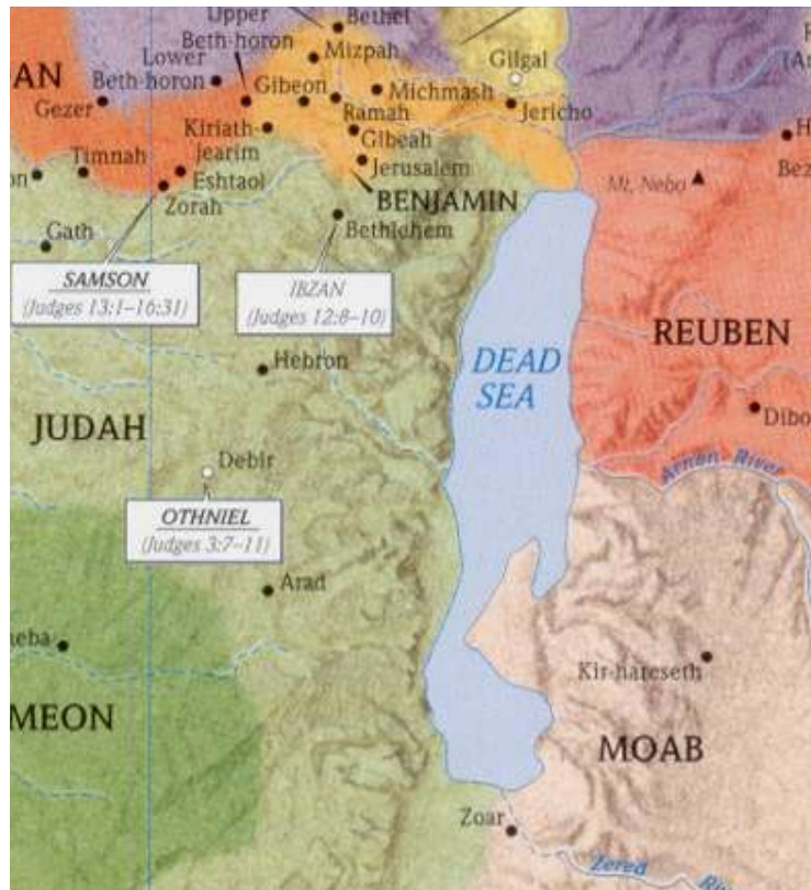
Figure 1.1: A zoomed-in view of Figure 1: Bethlehem is near the top of Judah in the center. Moab is to the lower right.

means “house of bread”. Judah means “praise”. It would be hard to have praise in the house of bread during a famine! Figure 1.1 shows the places of interest (on this map, we find Bethlehem rather than Bethlehemjudah).