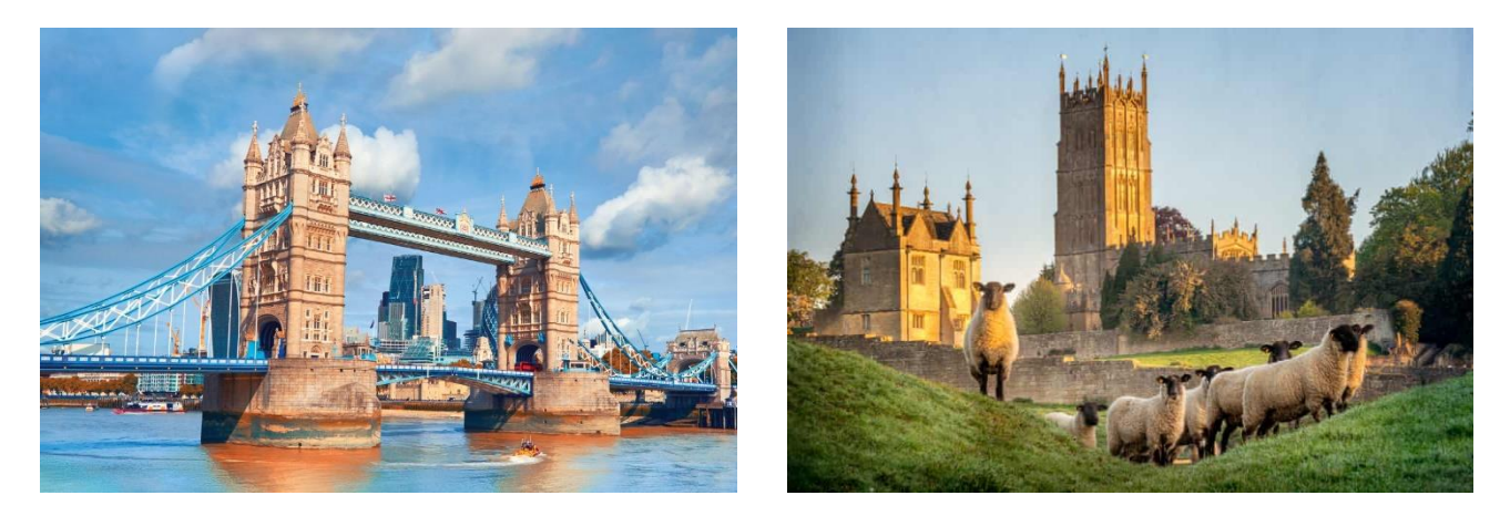
"The world is a book and those who do not travel read only one page" – St. Augustine of Hippo