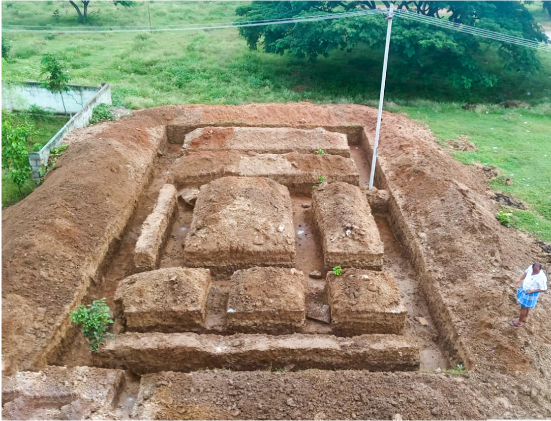
Foundation work at E-Thimmasandra village, E-Thimmasandra GP.

Foundation of both the Anganwadis are advancing towards completion!