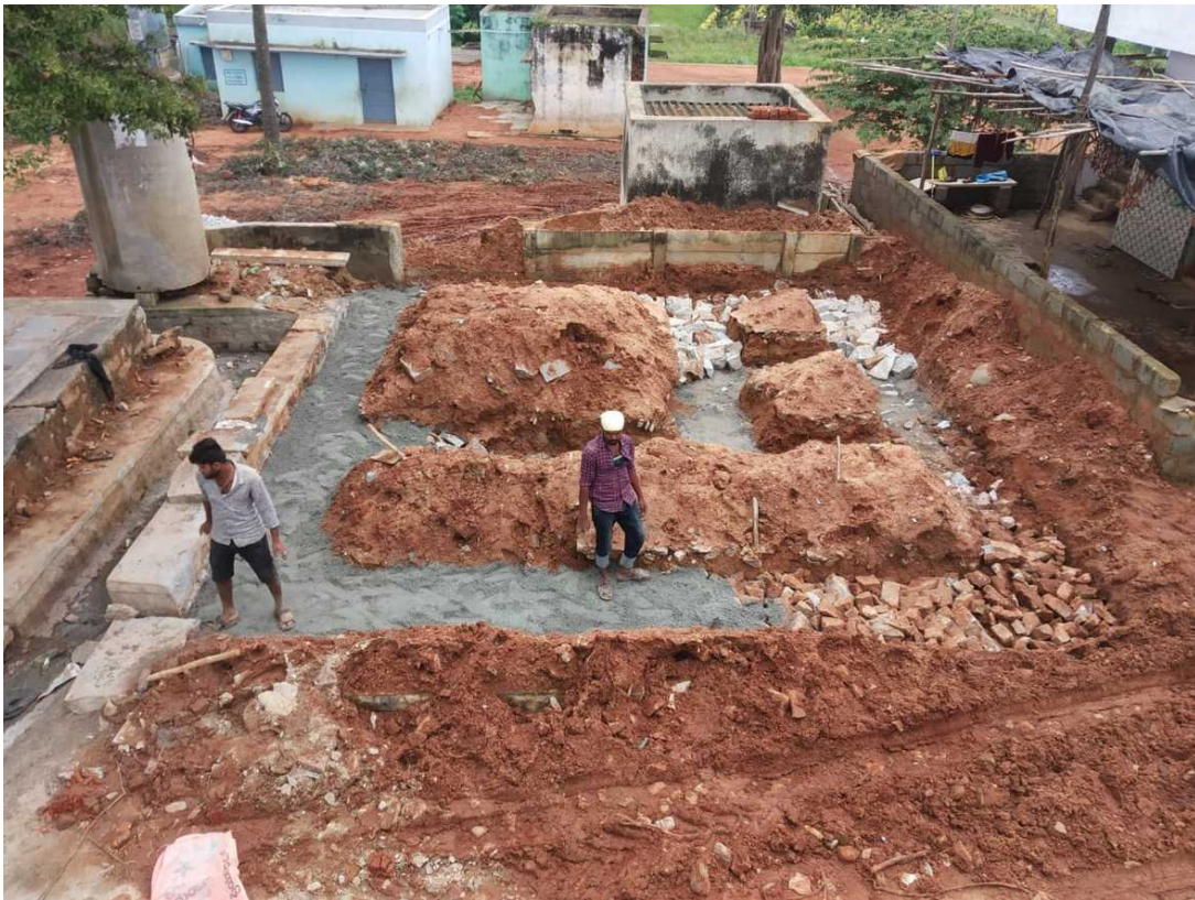
Foundation work at Kethenahalli village, S Gollahalli GP.

The CSEB machine sanctioned by the former CEO of Chikkaballapur District, is being used to make blocks for the Anganwadi at Kethenahalli village in S Gollahalli Gram Panchayat and we are happy with how beautiful the blocks look!