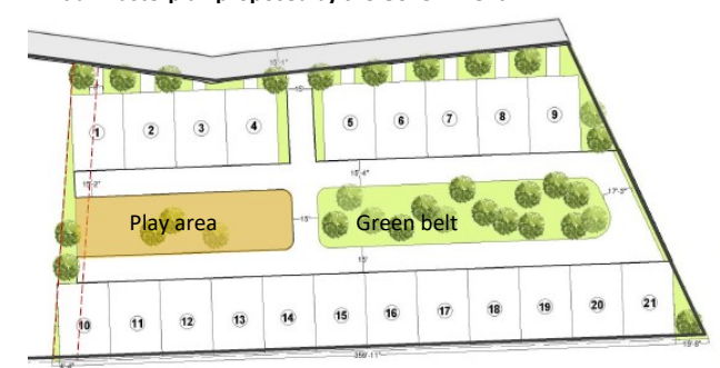
Nivasa's masterplan approved by the Government