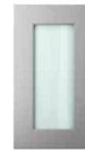
PLAIN FRAME includes clear glass