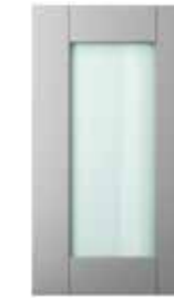
PLAIN FRAME includes clear glass